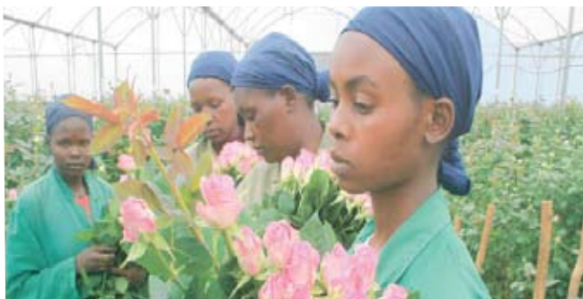
Unskilled Labour: Women provide the bulk of the unskilled labour in a number of flower farms in Uganda

The flower industry in Uganda has created employment for the people around the flower farms especially the unskilled and approximately over 80% are women according to the information gathered from the four flower farms that were contacted during the study.