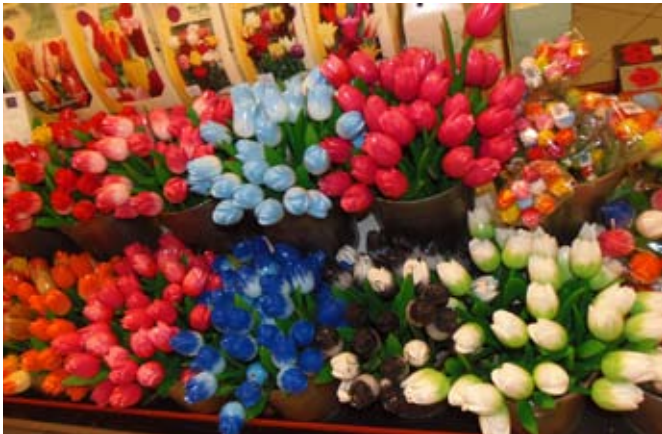
Capturing the Market: Artificial Flowers at Schiphol Airport

On the other hand, development has been rapidly taking place in the manufacture and marketing of low cost artificial flowers. Recent years, have seen the marketing cheap artificial flowers grow on many European markets. This growth has meant that natural flowers are slowly but steadily coming under completion from these artificial flowers. Mieko Hirano a Palo Alto Floral Design Examiner acknowledges the fact that fresh flowers are better than silk flowers in various senses such as the quality, looking, appearance and fragrance but goes ahead to note that some people today do like silk flowers better than fresh flowers due to a number of reasons. This emerging and growing; not only liking, but also use of artificial flowers is in one way a potential threat to the market for the natural flowers today and in the future. Potentially, such a threat should be looked at as one of the major challenges to the flower industry in Uganda and therefore to the economy of Uganda.